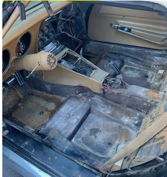
Prepping for carpet replacement.