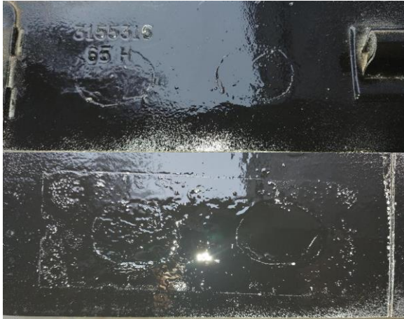
Figures 9 & 10.

Once the paint is dry, it is now time to add the white ink stamp on the driver's side and replace the foil label on the passenger side. The judging guide also provides that a green single digit number with clear border should appear somewhere on the driver's side top too. See Figure 11 for driver's side.