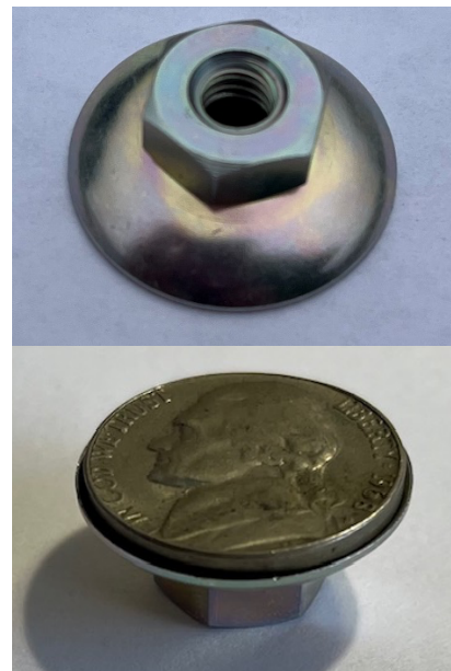
Close-up of Classic Industries washer nut.

Wanting to get additional information for other C1 cars, I contacted the team leaders. The 1953-55 team leader said the same washer nut was used on 1953-55 windshield T-bolts. The free spinning flange appears less cone shaped and flatter than the one pictured.