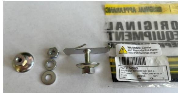
Classic Industries Paint Divider Clip & Nut Set.

Clip Set; 6-piece set comes with 12-24 free spinning washer nuts. Their website says they replace GM nuts 4646559 and 4644959. If you order either of these GM nuts by PN, ensure they are 12-24, as 10-24 is a more common size. When installing these fasteners, tighten them to 30 in-lb.