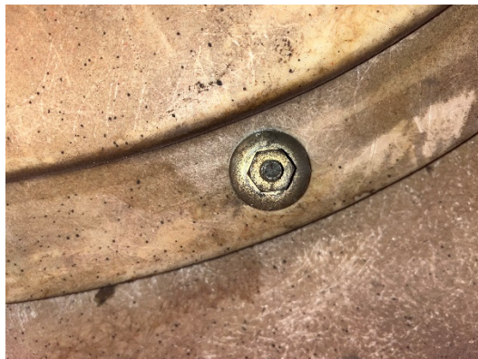
Washer nut installed under a '57 dash.

I have looked in the Assembly Manuals that I have access to. The 1957 AIM (Section B, Sheet 5) shows plain washer, split washer, nut. These are the same fasteners listed in the 1959 and 60 AIM. For 1961, the windshield T-bolts are attached with 9417553 nuts. I cannot find a reference for that PN. The T-bolts are threaded for 12-24 nuts. These flange/nuts are also listed as free spinning washer nuts or spinner nuts in fastener catalogues. They have a conical attached washer.